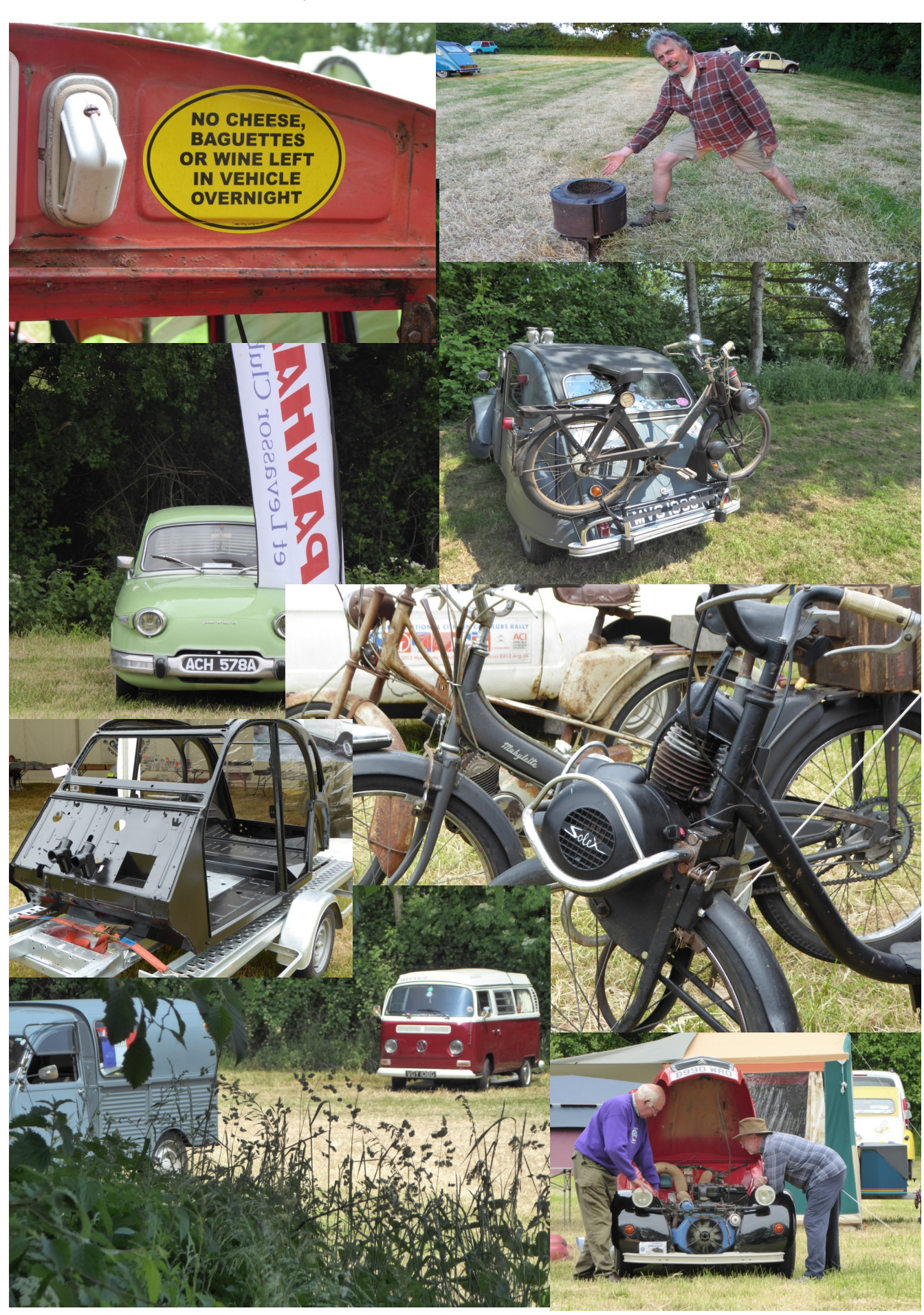
A Few Pics from the National 2017 Archive